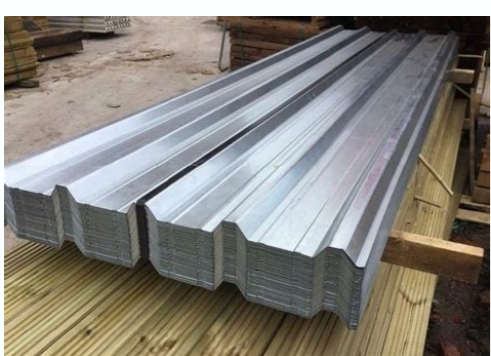
Metal box profile roofing sheets near me. Box profile roofing sheets cost. Galvanised box profile roofing sheets near me.